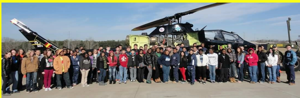
STEM Education Outreach Program visit with "Annie"